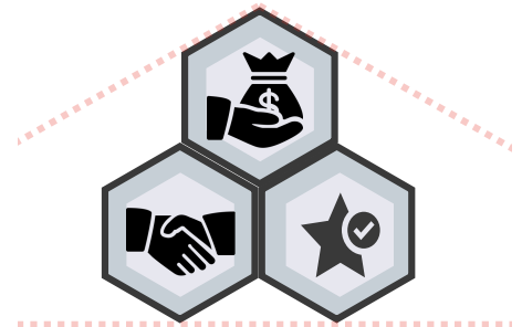
Part 3 Relationships and ROI

Solution Possibility Interview Narration Education