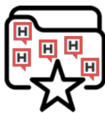
Part 2 Message Portfolio

Solution Possibility Interview Narration Education